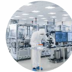
Chemical / Pharmaceutical